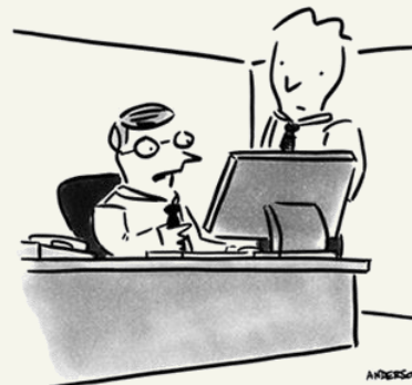
"I think I found the problem with your spreadsheet – it's a sudoku."